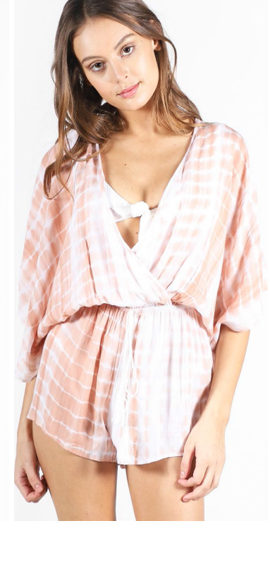
JC2611 MODERN LOVE PANT