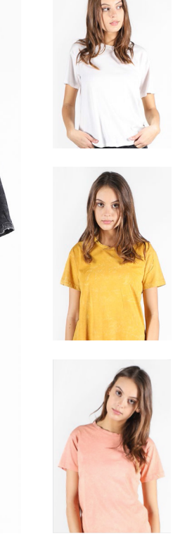
JD3653 BOYFRIEND CREW

BLACK | IVORY | AMBER | TERRACOTTA XS - L | 100% COTTON | MINERAL WASH USA: w/s $15 msrp $30 CAN: w/s $17.50 msrp $35