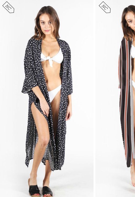
JC3402 YASMINE COVERUP

BLACK DOT | BLACK STRIPE OSFA | 100% VISCOSE USA: w/s $29 msrp $58 CAN: w/s $35 msrp $70